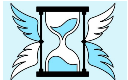
Image Description: The Instant Challenge logo for the 2025-26 season; in hand drawn art, a light blue minute timer or hour glass with wings

An Instant Challenge (IC) is a smaller Challenge that is a surprise to the team on the day of the tournament. An Instant Challenge may involve a task, a performance, or a combination of both. Instant Challenges usually last ten minutes or less.