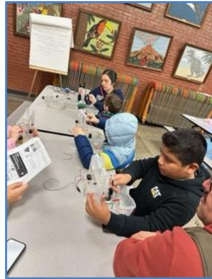
Image Description: students solving instant challenges, sitting or standing around a table or workspace.