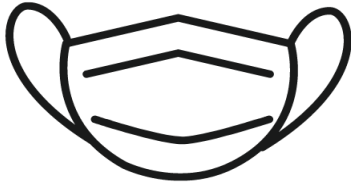
Image description: A black and white pictogram of a protective face covering.

Our event will adhere to local health and safety restrictions. At this time, masking and vaccinations are optional.