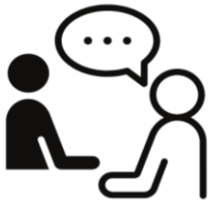
Image description: A black and white pictogram of two figures having a conversation. A speech bubble above them reads "...".

The Awards Celebration at the Affiliate Finals Tournament will be presented in English. Most Team Presentations will be shared in English. Signage throughout the event will be available in English.