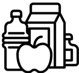
Image description: Black and white pictograms of food and drink such as an apple, water bottle, and milk carton.

No food and drinks will be available or provided during the Affiliate tournament. The exception is that Oregon DI will provide food for appraisers and other tournament-assigned volunteers. If a participant who is NOT an appraiser has a health crisis (example, low blood sugar)