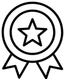
Image description: A black and white pictogram of a medal with a star in its center.

There is no awards ceremony at the end of the Affiliate Showcase as Teams receive feedback, but not comparative scores.