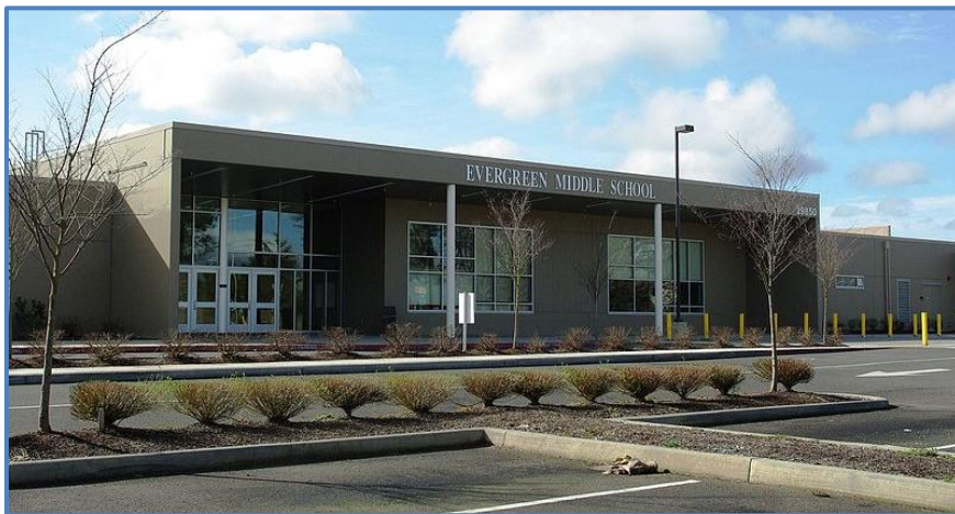
Image description: front of main entrance of Evergreen Middle School in Hillsboro, OR. Picture taken from accessible parking spaces. White double doors enter nearest registration table.

At the Affiliate Finals Tournament at Evergreen Middle School in Hillsboro , there are a number of accessible parking spaces available in the main parking lot in front of the school. These spaces are located nearest the Main Entry. From the accessible parking area, the entire school is on one level with no stairs . From the accessible parking, the main entrance is approximately 50 feet from the parking area.