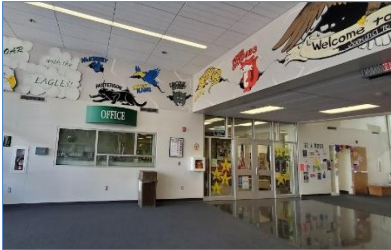
Image below is the main lobby inside the main double white doors.

Presentation Sites are located throughout this VERY SPACIOUS venue. If needed, we recommend bringing your mobility device with you to help manage the distances between sites.