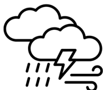
Image description: A black and white pictogram of storm clouds with lightning, rain, and wind.

If inclement weather will have any impact on the tournament schedule, teams will be notified via email or text message to Team Managers.