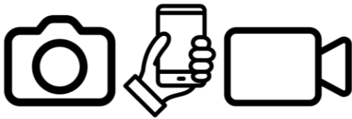
Image description: Three black and white pictograms of a camera, cell phone camera, and a video camera.

Photos/videos of a team's Presentation may only be taken if the team has given permission. This information will be announced before the team begins its Presentation.