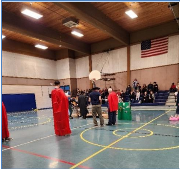
Image description: example of a Presentation sites. The first is an elementary school gym with a student team and adults standing on the gym floor, and other adults sitting in the pull-down gym seating.

The second picture, shown on the next page, shows adult appraisers and students standing in an elementary school classroom.