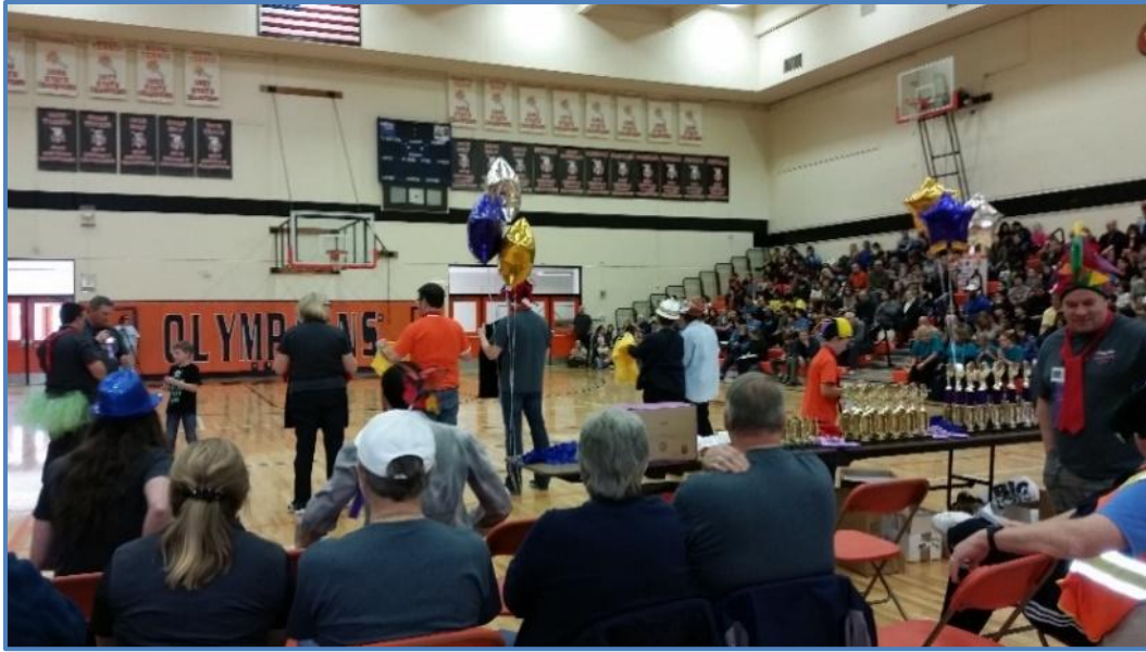
Image description: previous Awards Celebrations that show spectators sitting in the bleachers, tables with medals, awards and balloons, adults standing to present awards (some in costume) and students with ribbons and certificates.