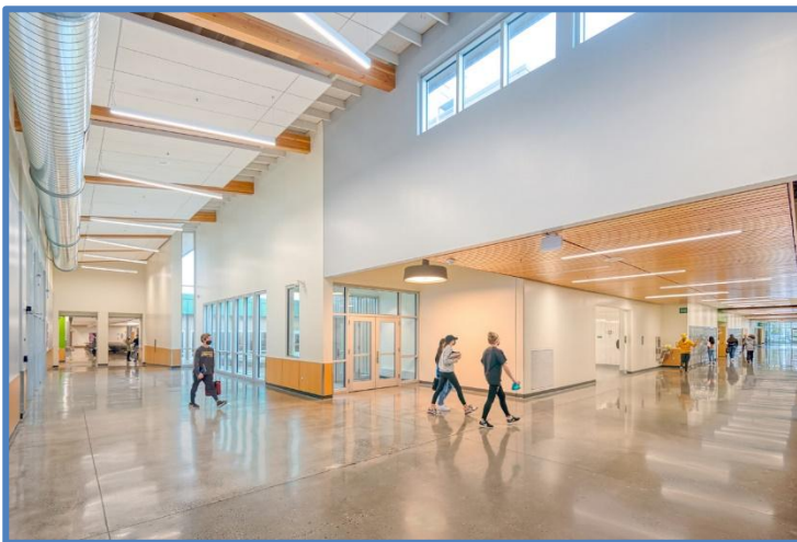
Image description: Central hallway from front entry (registration desk on the right) to the Commons area on the left.

Presentation Sites are located throughout this VERY SPACIOUS venue. If needed, we recommend bringing your mobility device with you to help manage the distances between sites.