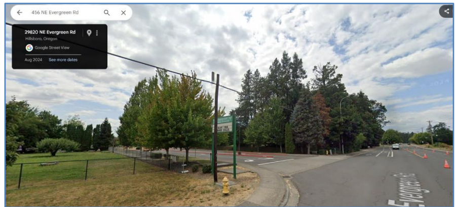
Image description: top picture shows Evergreen Blvd, West bound, with the entrance to Evergreen Middle School on left.

Where: Evergreen Middle School, 456 NE Evergreen Blvd, Hillsboro