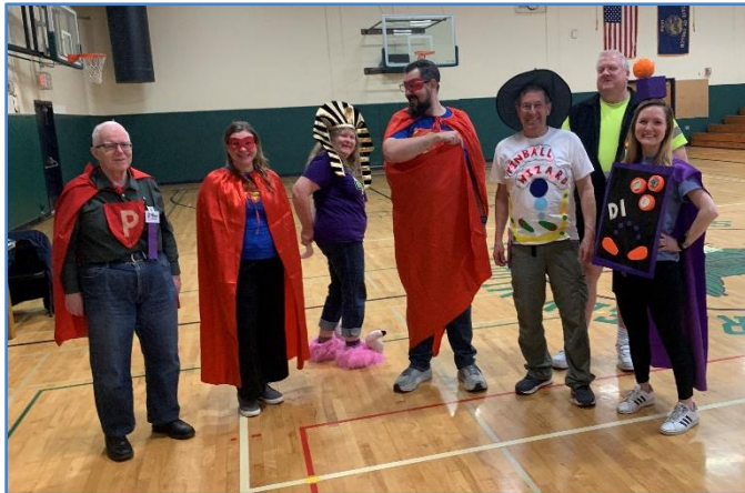
Image description: several adults in costume standing in a semi-circle in a gym. In this case, these are appraisers, adults who evaluate team performances, having fun at a tournament.