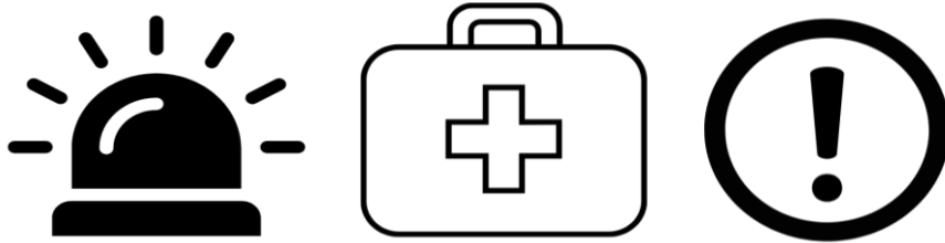
Image description: black and white pictograms of an alarm light, first aid kit, and an alert sign with an exclamation point.

The fire alarms in the building have flashing lights and loud repetitive sirens. If the need for an evacuation arises, please follow posted exit signage to safety.