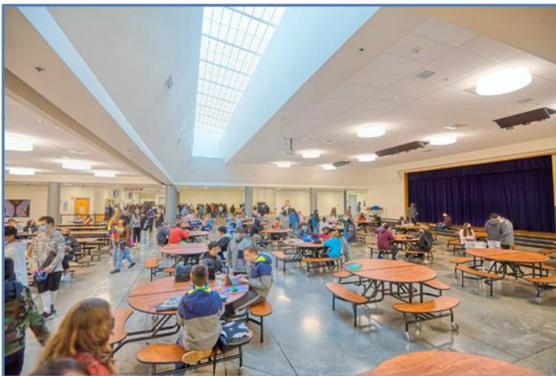
Image Description: picture shows Commons at Evergreen Middle School. This area is where teams relax during the day. Please keep food and beverages in this area.

Teams and spectators are welcome to bring their own food and drinks. (HINT: The Team Managers are working with the kids! This is a great task for team parents or supporters.) We ask that you enjoy your food and drinks in the Commons at the Affiliate Finals Tournament in Hillsboro. Anyone seeking an allergen-free space may utilize a separate area. Please check with the Affiliate Director at the Registration Desk at each event.