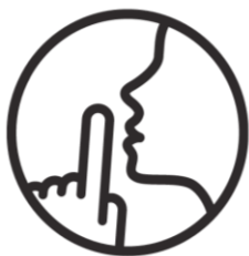
Image description: A black and white pictogram showing a face in profile. One finger is raised toward the lips to make the "Shhh" gesture.

A Quiet Room/Regulation Room will be available on the day of the tournament or showcase . We will have the space identified on the day of the tournament or showcase and post it at the Registration Desk. This space is