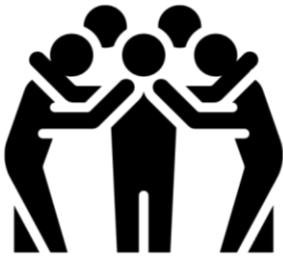
Image description: A black and white pictogram of a team in a huddle formation.

Throughout the event, Destination Imagination (DI) teams will be presenting their work on a Team Challenge . The Team Challenge falls into one of seven categories: Technical, Scientific, Fine Arts, Improvisational, Engineering, Service Learning, or Early Learning. You can learn more about this year's Team Challenges on the DI website . Each Team Challenge has its own Presentation Site, or rooms specific to the Challenge. The size, seating options, and acoustics will vary greatly by Presentation Site.