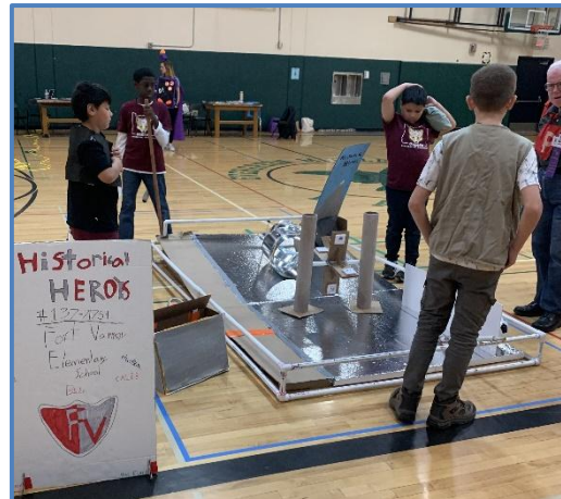
Image description: four students in street wear around props made by the team to help solve the selected challenge.