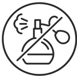
Image description: A black and white pictogram of a perfume bottle that has been crossed out.

Out of respect to those with sensitivity to scent, please avoid wearing perfumes or colognes.