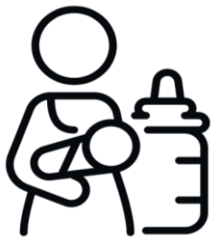
Image description: A black and white pictogram of a parent holding an infant alongside a bottle.

A private space exclusively for nursing parents will be available on the day of the Showcase or Tournament if requested in advance.