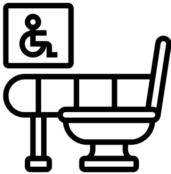
Image description: A black and white pictogram of a toilet with a grab bar. Above it, the symbol for accessibility is displayed on the wall.